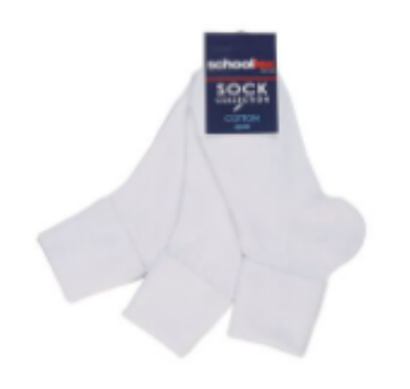
$12.99 \heartsuit Schooltex Cotton Socks 3 Pack