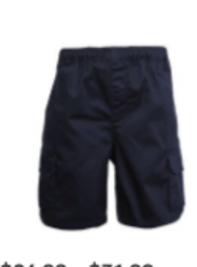
\odot $26.99 - $31.99 Schooltex Drill Cargo Pocket Shorts