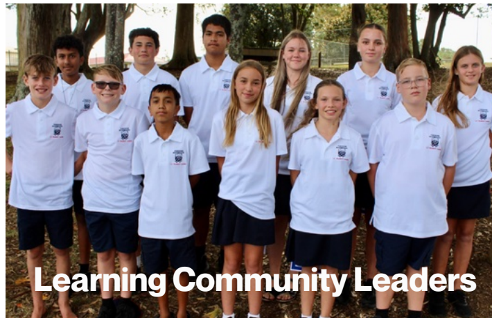
Learning Community Leaders